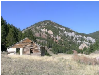
Close to Drummond, Rattler Gulch presents a fine example of Madison limestone.

As most of you know, the lower part of the Rattler Gulch climbing area -- an area that was already private land -- was bought by a Texas family last year. The family erected a fence and posted the property, which includes the Diver's Wall and the wall that holds St. Louis Direct and a few other climbs. The family has no plans to live on the property, but does plan to run cows on the acreage.